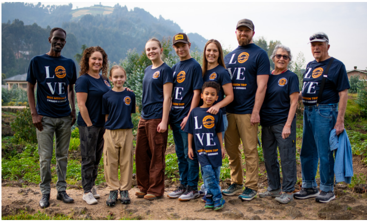
The 2025 January mission trip crew helped repair and bring water to the girls dorm at Rwankeri Adventist Academy!